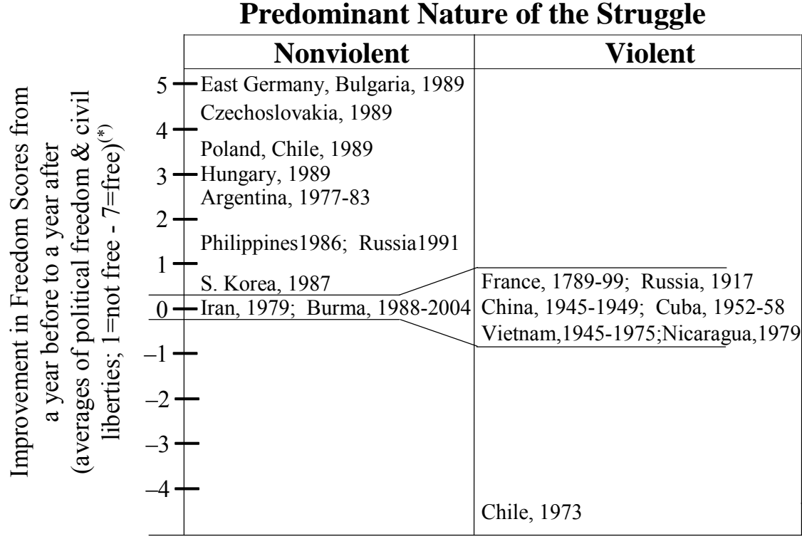
(*) Freedom House scores for events since 1973; author's assessment for previous events; see the text and Appendix 1.

scores from before to after the events. For example, the upper left corner of the figure lists "East Germany, 1989". The 1987-88 Freedom House report, the year before the Berlin Wall was dismantled, gave East Germany a score of 7 for political rights and 6 for civil liberties, while the 1990-91 report assigned scores of 1 for political rights and 2 for civil liberties to the reunited Germany. This represents an improvement of 5 = [(7+6)/2] - [(1+2)/2] steps on the Freedom House scale from before to after the fall of the Berlin Wall. This rationale was used to describe "East Germany, 1989" as experiencing an improvement of 5 Freedom House steps in Figure 2.